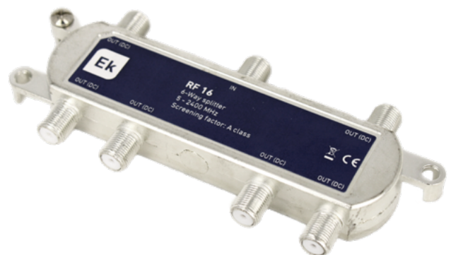
RF 16 · RF 18