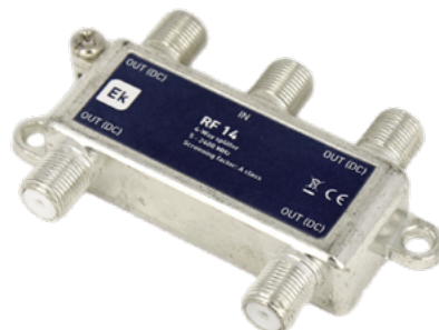
RF 13 · RF 14