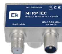
MI RP IEC