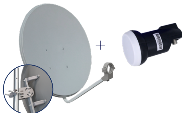
ODS60 + LNB 11