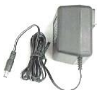
Power supply X2