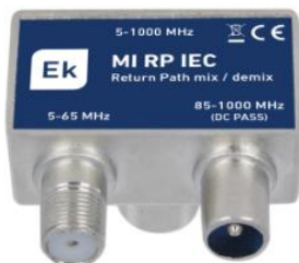
MI RP IEC X2