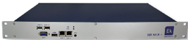
EK LINK R