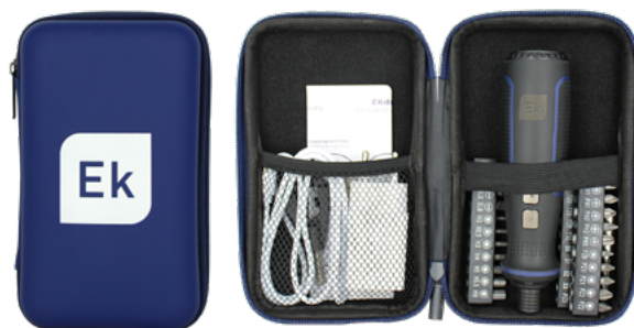
Ek DRIVER cover

Battery holder (lithium battery is included)