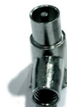
C 95 M C 95M 6