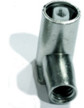
C 95 H C 95H 6