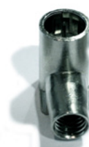
CF 90 CF 90-6