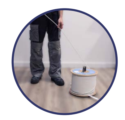
EK ROLLER COIL UNWINDDING