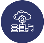
ACCESS TO MULTIMEDIA SERVICES WITH MOBILE DEVICES AND HOSPITALITY TV