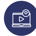
OTT - WIFI STREAMING SERVICES