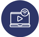
OTT - WIFI STREAMING SERVICES