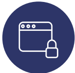
SECURE INTERNET ACCESS WITH INFORMATION CLASSIFICATION AND NETWORK AUDIT