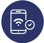
FAST AND SECURE (BYOD) MOBILE CONNECTIVITY