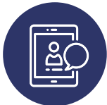
HOTSPOT, WELCOME PORTALS DIGITAL MARKETING