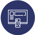
TV, TDT, SAT AND IPTV CHANNEL PROCESSING AND DISTRIBUTION