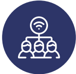
SCALABLE WIFI COVERAGE

Based upon in-house technology, EK has a wide range of professional equipment which enables the generation of multimedia environments produced in hotels , either by upgrading existing infrastructures without any works being necessary, or by implementing advanced FTTR (Fiber-To-The-Room) systems over optical fibre.