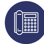
IP TELEPHONY DISTRIBUTION PLATFORM