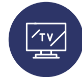
CATV / HFC