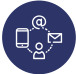
CREATION OF INFORMATION CHANNELS